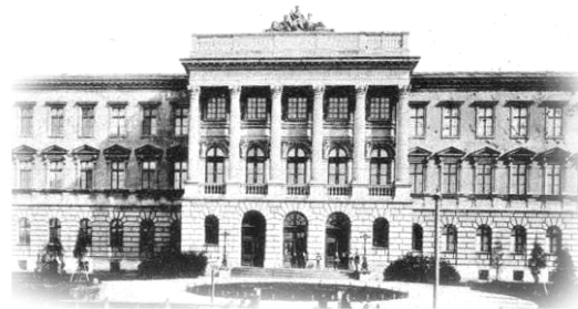
Lviv Polytechnic National University Main Building

Lviv Polytechnic National University Students' and Ph.D. Students' Union and Self-government Young Scientists' Council